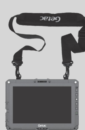
Attaching to the Tablet