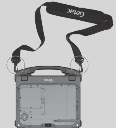
Attaching to the Detachable Keyboard